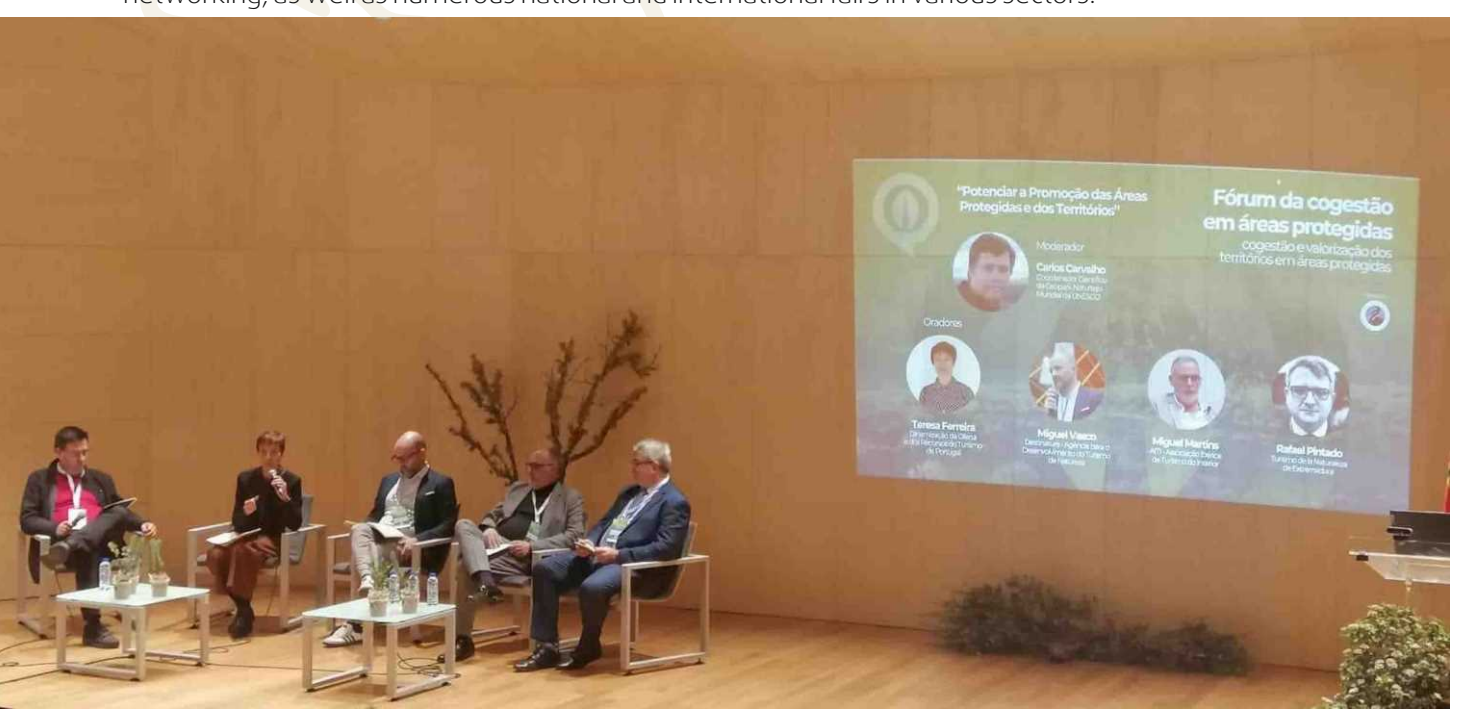
December 6th and 7th - Forum "Co-management and valorisation of territories in protected areas"

and the art of know-how. Each sip is a journey that extends its roots into schist and sandy soils. Since 2017, the Geopark and the Herdade have worked closely together, with many joint promotional activities, networking, as well as numerous national and international fairs in various sectors.