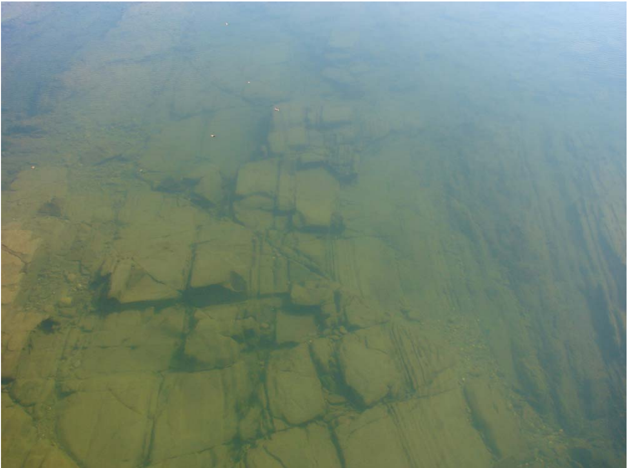
Photo Geopark of the month – “Tectonics from a medieval point of view” . Crossing the medieval (Roman?) bridge of Ladeira, clear waters on the Pracana river bottom allow to see the Padrão-Silveira Unit (Vendian-Middle Cambrian) coarse-grained metagreywackes with some schists almost vertical (dipping 70° NE) broken by WNW-ESE left strike-slip fault. In this fault zone, close to the border of Geopark Naturtejo, there are the Ladeira thermal springs showing that some of those faults are still active.